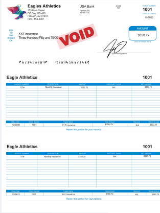
Business Account Checks